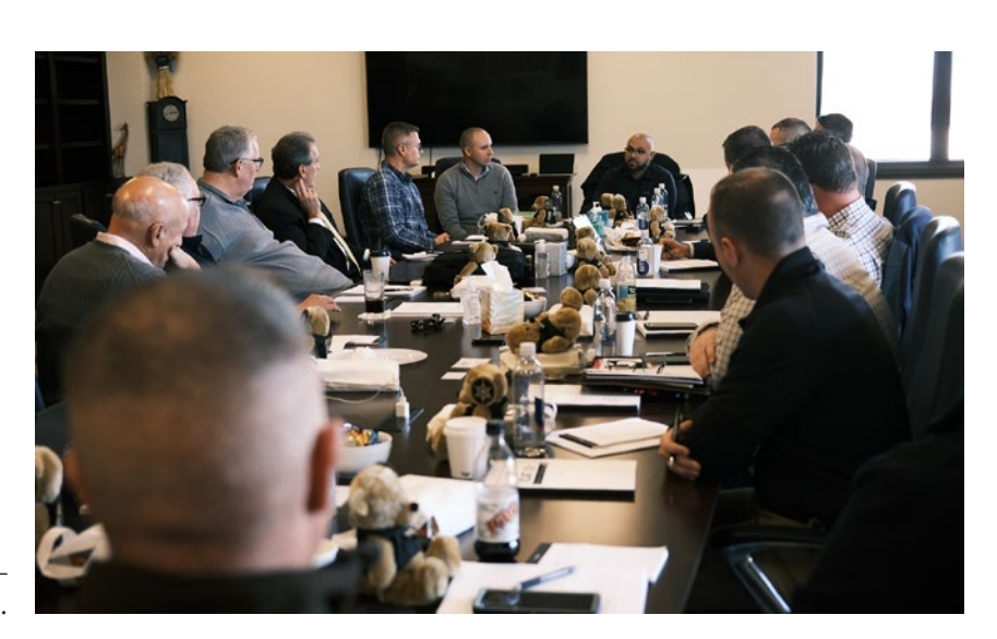
The ICAT in Jails Exploratory Meeting.

Many of the jail experts PERF consulted with said that, far from a sign of weakness, practicing ICAT principles – sound communications skills, threat assessment, tactics, and decision-making – is a demonstration of strength when done effectively. By showing respect for the individuals they are dealing with, correctional officers can actually build up their credibility with the inmate population.