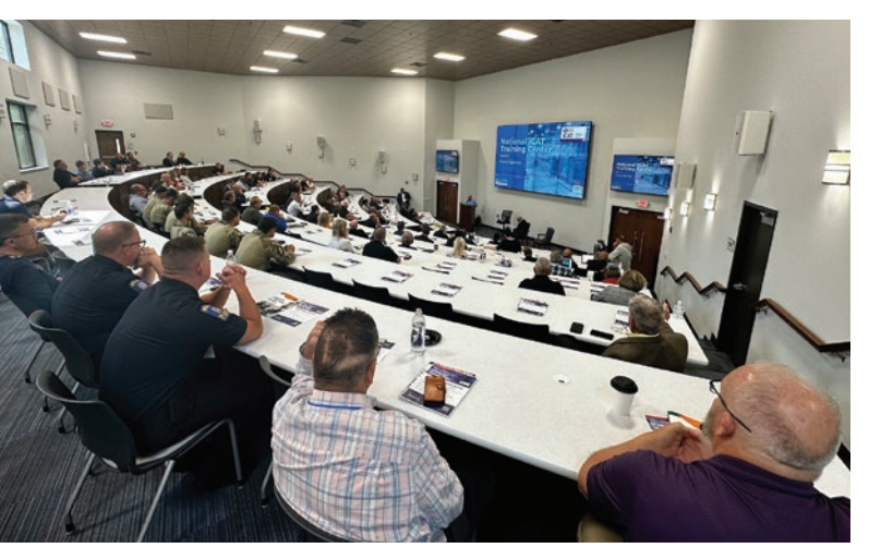
ABOVE: National ICAT Center auditorium. RIGHT, BOTH PHOTOS: National ICAT Center Jail Intake Room

The training center also includes a dozen different scenario-based training venues spread over 22,500 square feet. In addition to venues simulating locations where patrol officers frequently operate (convenience store, fast-food restaurant, hospital, school, etc.), the facility has a separate venue that mirrors a correctional facility, including prisoner intake, day room and recreation area, and eight prisoner cells. This venue is ideal for carrying out scenarios in the ICAT for Jails curriculum.