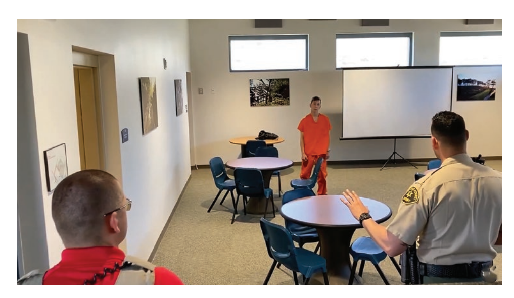
The Santa Cruz County Sheriff's Office conducts live scenariobased ICAT training.

The Santa Cruz County, CA Sheriff's Office has used the CDM to debrief some critical incidents within its jail. Officials say the CDM helps them structure the afteraction sessions, focusing on key issues such as information gathering, crisis recognition and tactics, and identifying strengths and weaknesses in an objective, non-judgmental fashion.