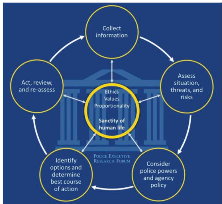
The Critical Decision-Making Model (CDM)

The CDM includes five steps that officers should work through when they are responding to any incident, but especially a potential use-of-force encounter: