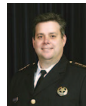
New Orleans Police Superintendent Ronal Serpas

Note: The article below is excerpted from a more detailed report, which is available at http://bit.ly/1luY7aW .