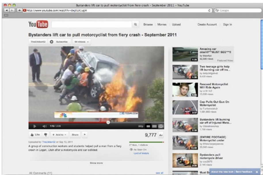
Screenshot of video showing bystanders lifting a burning vehicle so that the motorcyclist trapped underneath could be pulled to safety. Video is available online at http://www.youtube.com/watch?v=UxjttLX1ugM and http://abcnews.go.com/US/motorcyclist-pulled-car-cried-mangled-bike/story?id=14528893

Many of you may have seen the video earlier this year of the traffic accident in which a motorcyclist was trapped, unconscious, under a burning car. Police and EMS hadn’t arrived yet, so citizens rushed over and lifted up the car so they could